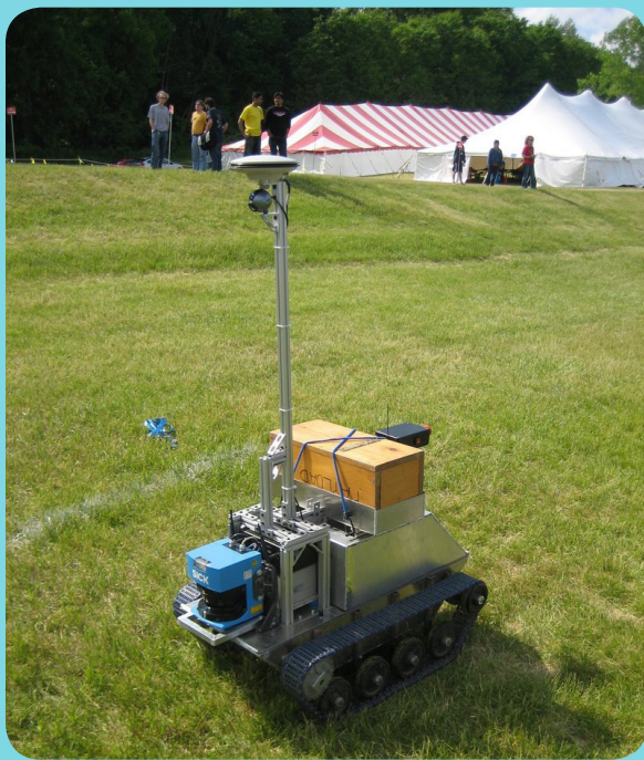
Figure 1: PSU Robotics IGVC Entry