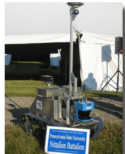
Figure 4: PSU Robotics Club UGV- The Nittalion Battalion