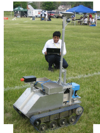
Figure 2: Competing in the navigation challenge at IGVC