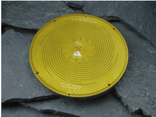
Figure 2: NovAtel's Pinwheel™ Design

The design of NovAtel's 704X antenna is an evolution of NovAtel's Pinwheel™ antenna family. It has approximately a 20% increase in bandwidth and maintains excellent electrical characteristics across the band. NovAtel's patented Pinwheel™ coupled slot array design is shown below (see Figure 2 ).